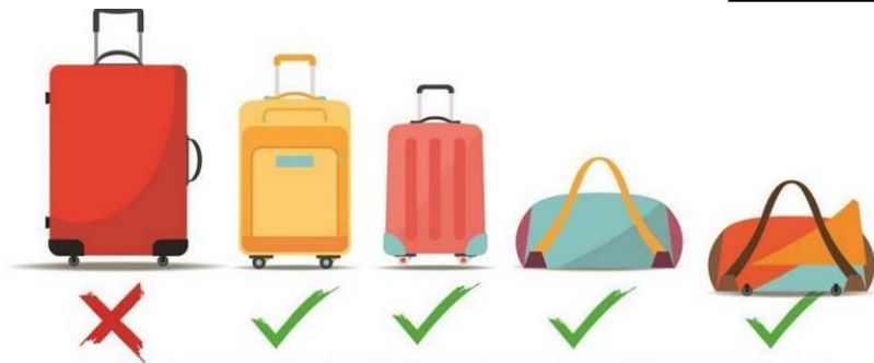
HARD-SIDED BAGS NOT PERMITTED